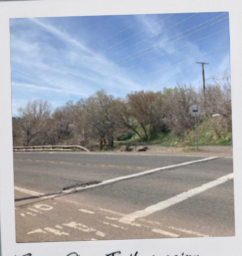
Susan River Trail crossing Riverside Drive