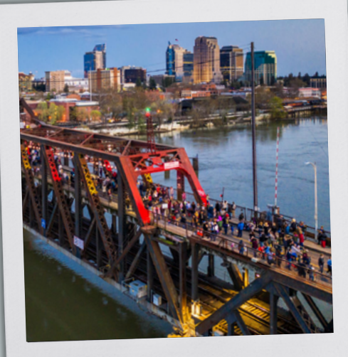
I Street Bridge Outreach Event