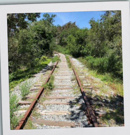
17th Avenue to State Park Drive