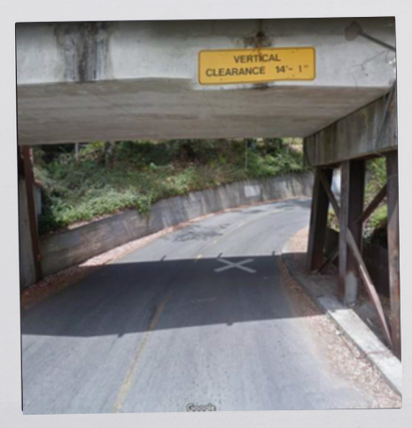
New Brighton State Beach Access Road