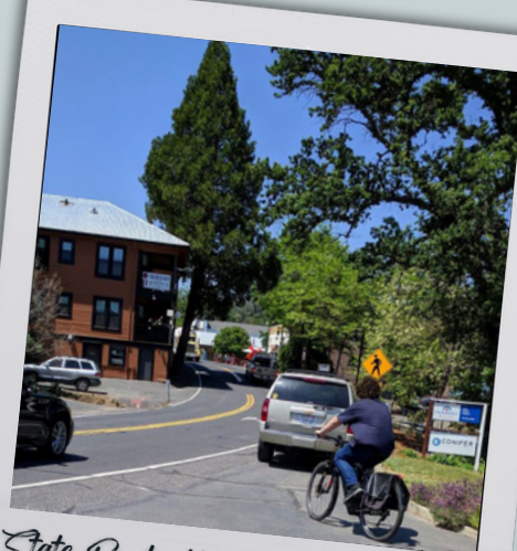
State Route 120 at junction with Ferretti Road