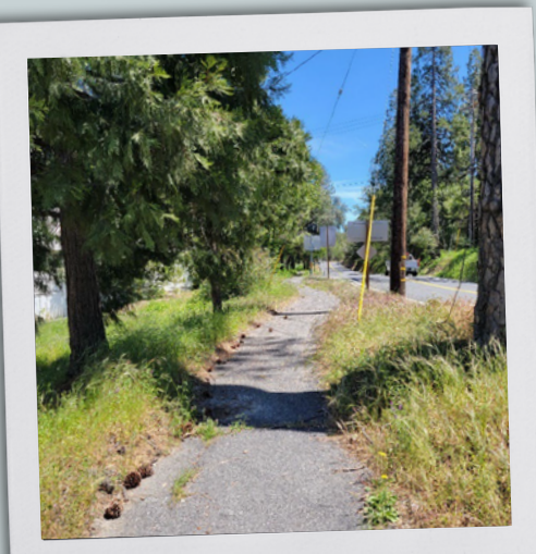
State Route 120 - Existing pathway alignment