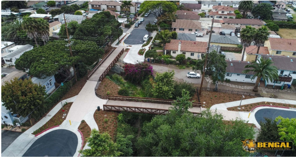
(Post-construction) New Bridge along Cacique Street (left center) New Bridge at Soledad terminus (bottom center)