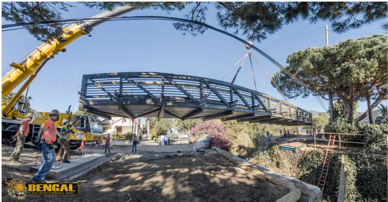
(During Construction) New Bridge on Cacique Street