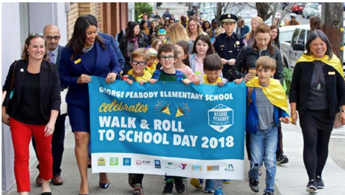
Example of a walking school bus as part of a Walk & Roll to School Day event

SF-SRTP education and encouragement activities included: