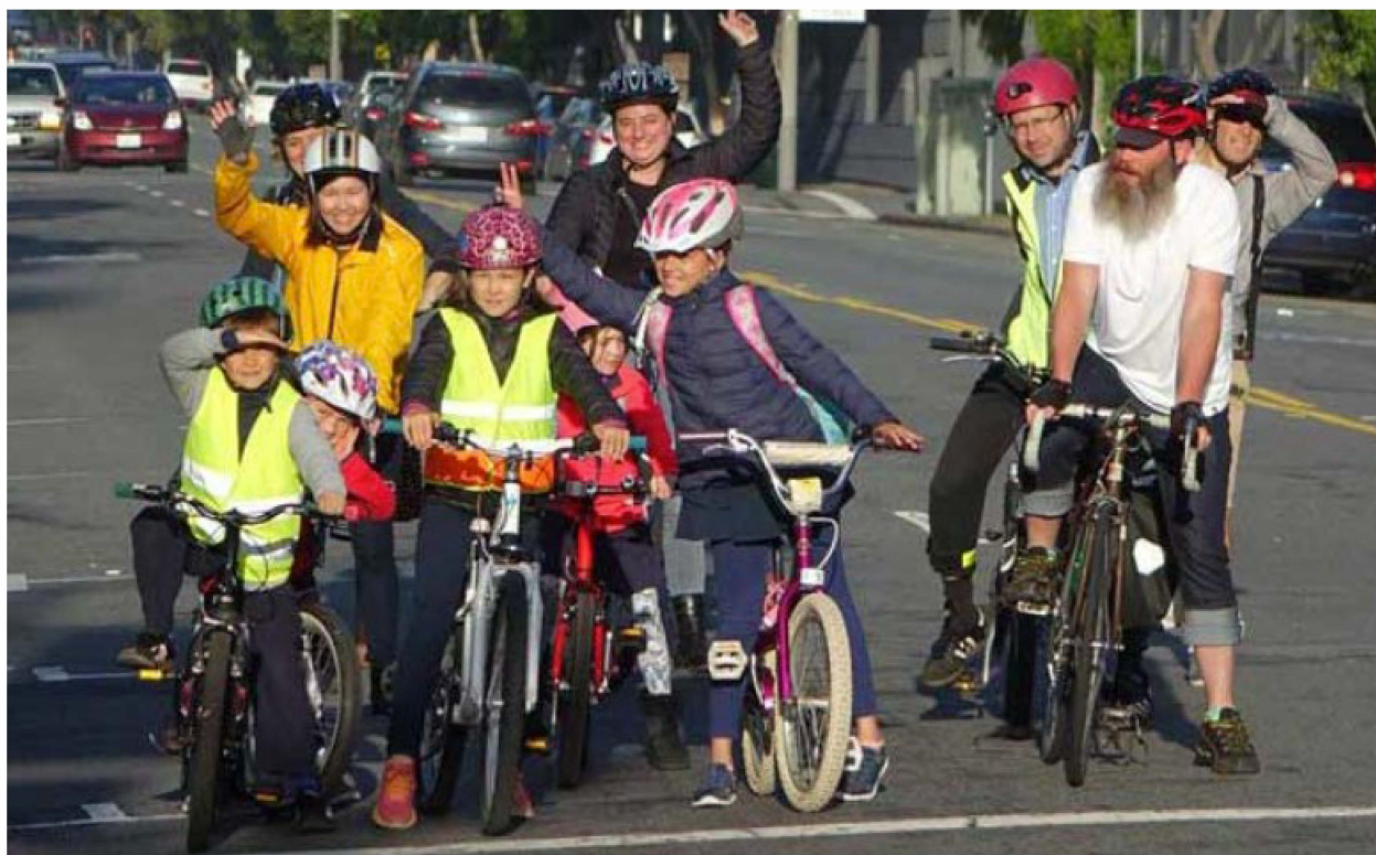
Parents fully engaged with students on their way to school

The SF-SRSP successfully demonstrated an increase in walking, biking, and transit usage. It heightened awareness of safe active travel with inclusive, parent-led, travel groups (aka walking school buses) and neighborhood bike groups.