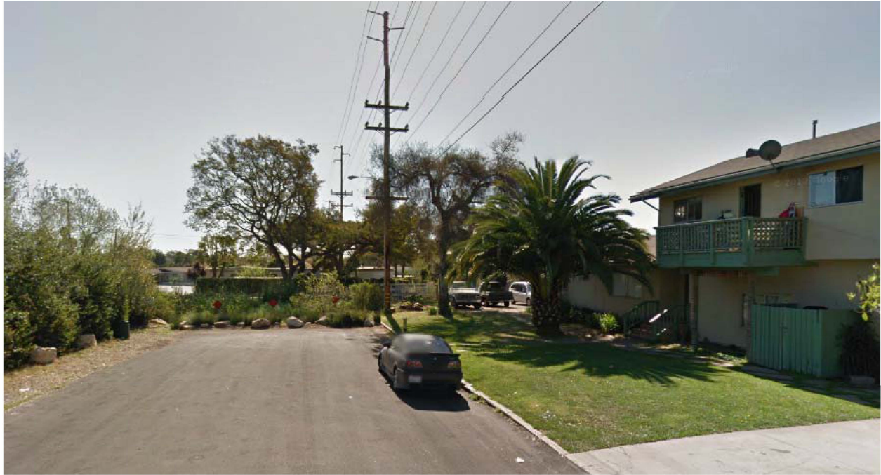
(Pre-construction) Soledad Street Dead-end at Sycamore Creek