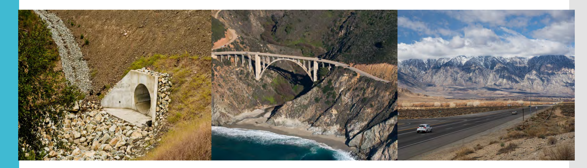
Adaptation Priority Reports - Link