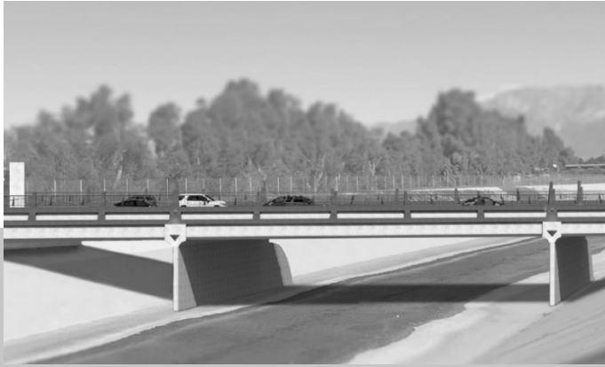
Rendering of the New Bridge