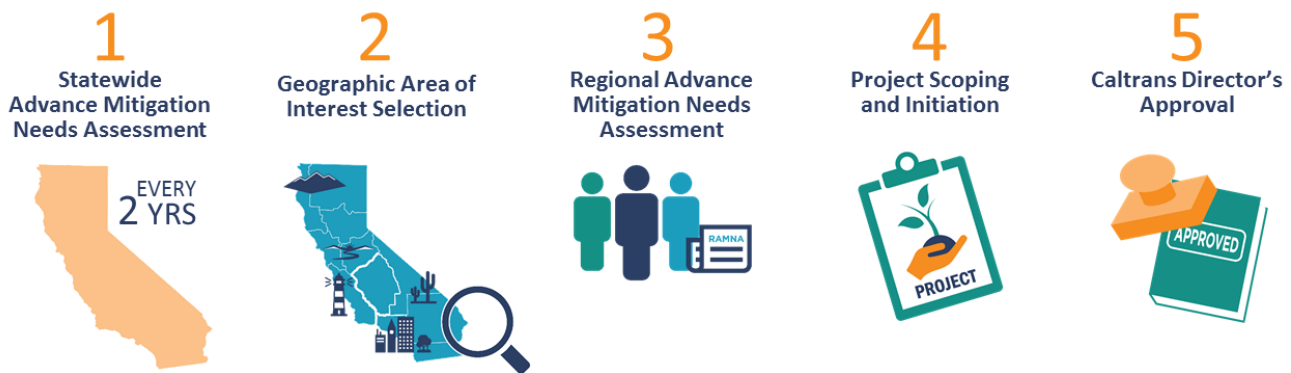
Figure 3. Advance Mitigation Program Planning Phase

Through the Advance Mitigation Program planning process, Caltrans aims to maximize the environmental benefits of planned mitigation while providing time-and cost-savings for the delivery of transportation projects. The Advance Mitigation Program planning process consists of five steps culminating in the Caltrans Director's Approval under Streets and Highways Code Section 800.6(i). As none of these planning activities can be funded from the Advance Mitigation Account, the Advance Mitigation Program has worked with the Department's Division of Transportation Planning to secure sufficient planning resources for the Caltrans districts to perform these planning activities, including the nomination and scoping of advance mitigation projects. The five steps of the Advance Mitigation Program planning phase, as illustrated in Figure 3, are as follows: