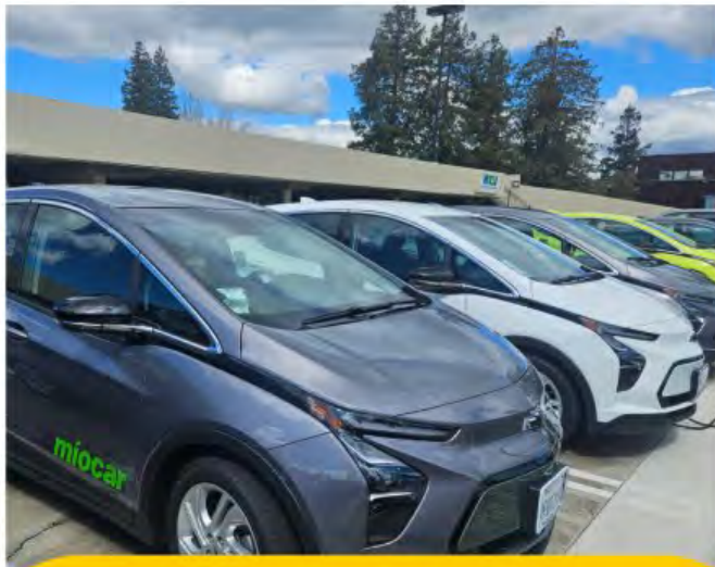
Chevy Bolt 240 mile range