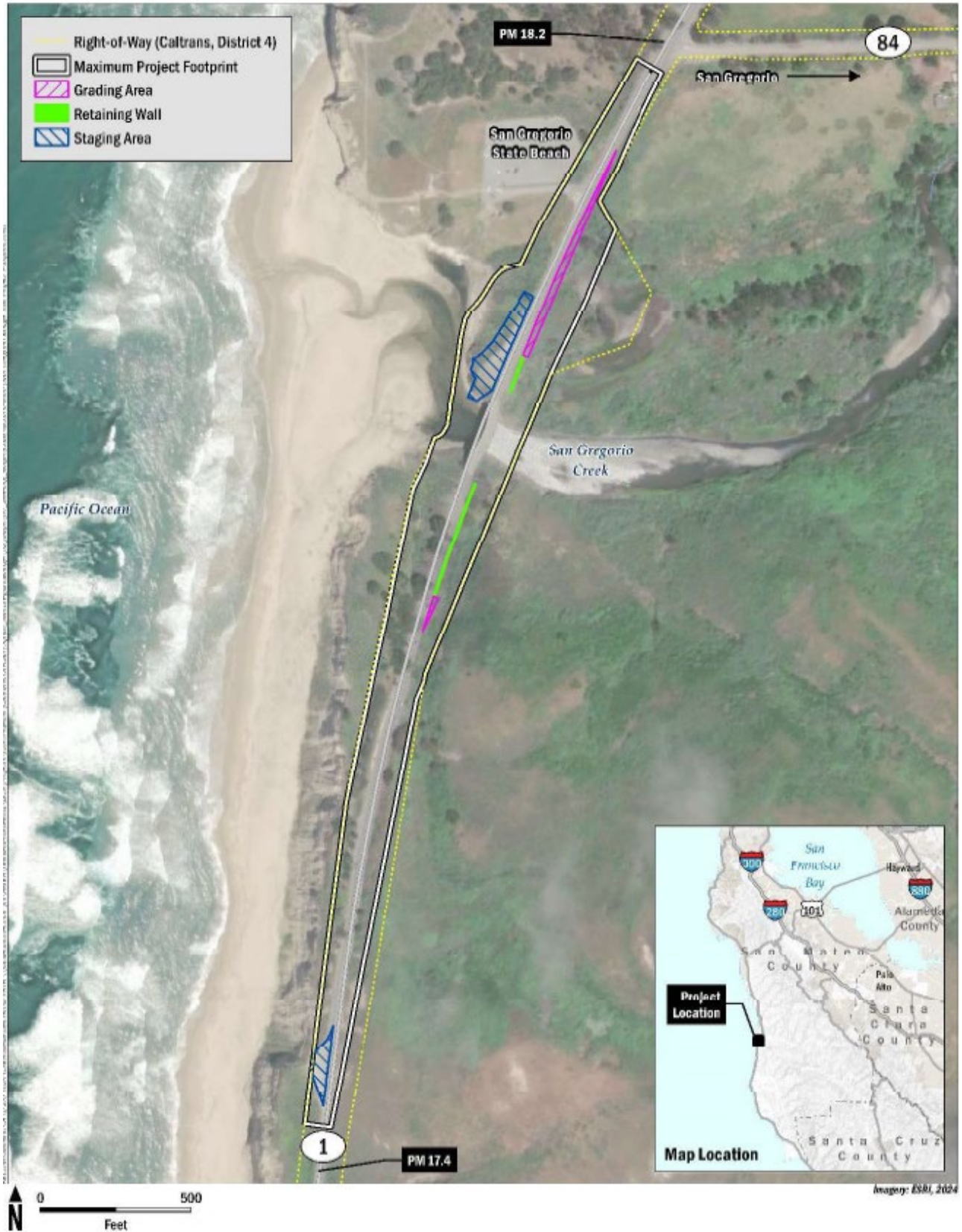
San Gregorio Creek Bridge Project