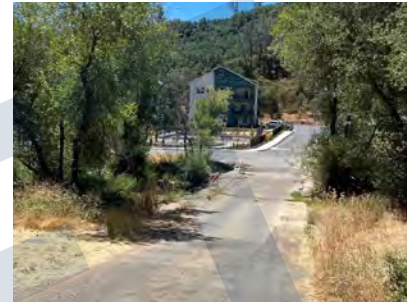
Fournier Road during normal conditions