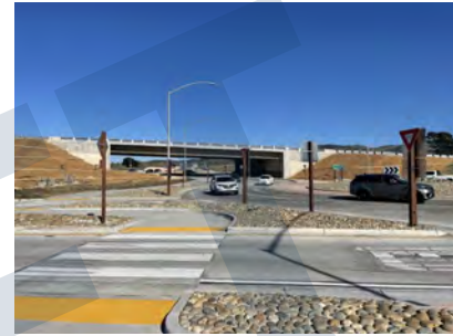
Soscol Junction crossing improvement