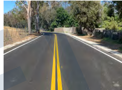
Woodview Road – After