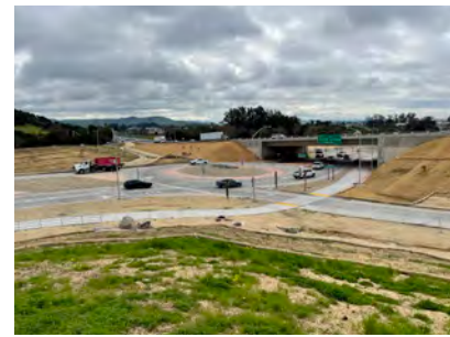
Soscol Junction roundabout

Pursuant to Streets and Highways Code Section 2397, project information, including scope, cost, schedule, benefits, and outcomes for all projects funded by the Solutions for Congested Corridors Program are available on the California Department of Transportation's Senate Bill 1 Semi-Annual Progress Reports webpage.