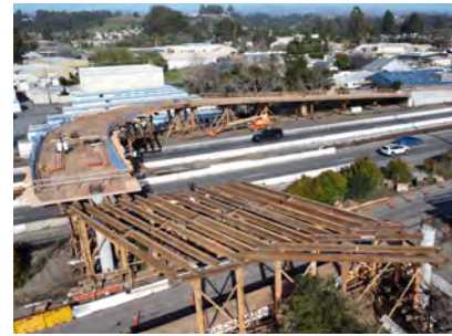
Construction of Bicycles and Pedestrian Overcrossing

Program Webpage: https://catc.ca.gov/programs/state-transportation-improvement-program