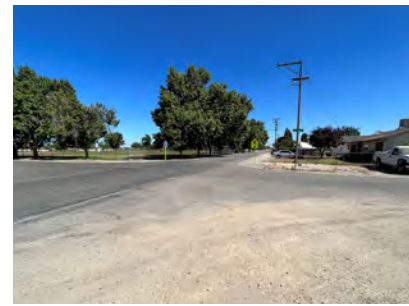
Biola Avenue – Before

Program Webpage: https://catc.ca.gov/programs/active-transportation-program