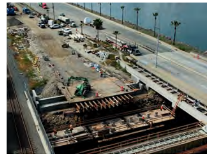
Port of Los Angeles Rail System Efficiency Project

Program Webpage: https://catc.ca.gov/programs/sb1/trade-corridor-enhancement-program