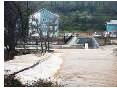
Fournier Road during flood conditions

Program Webpage: https://catc.ca.gov/programs/sb1/local-streets-roads-program