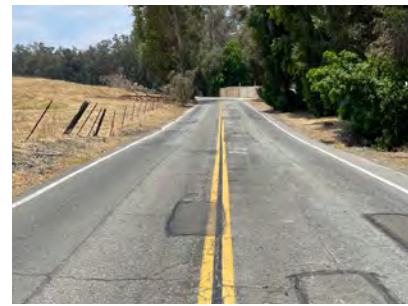
Woodview Road – Before

Program Webpage: https://catc.ca.gov/programs/sb1/local-streets-roads-program