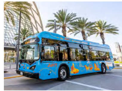
Anaheim Transportation Network’s electric bus

Program Webpage: https://catc.ca.gov/programs/transit-intercity-rail-capital-program