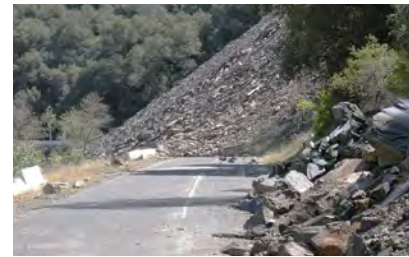
State Route 140 Slide Rock Shed Project – Before

Program Webpage: https://catc.ca.gov/programs/state-highway-operation-and-protection-program