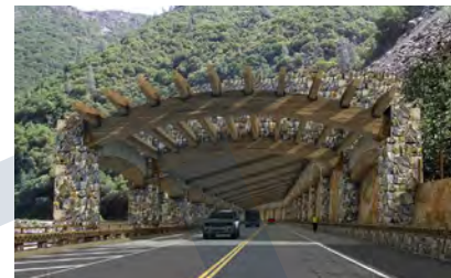
State Route 140 Slide Rock Shed Project – After (rendering)