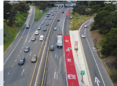
Bus on Shoulder Lanes