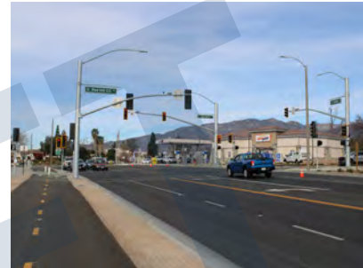
Foothill Boulevard – After