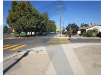
Biola Avenue – After