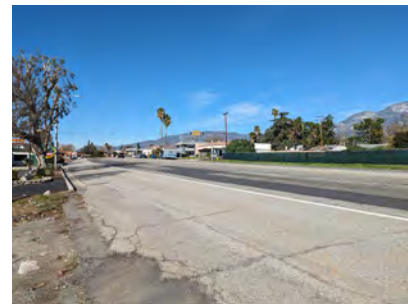
Foothill Boulevard – Before

Program Webpage: https://catc.ca.gov/programs/sb1/local-partnership-program