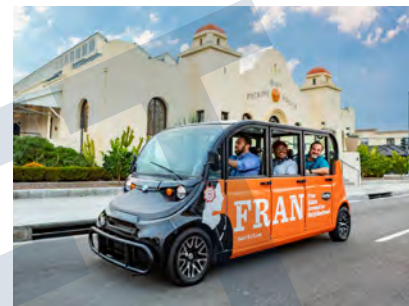
Anaheim Transportation Network’s FRAN micro-transit service