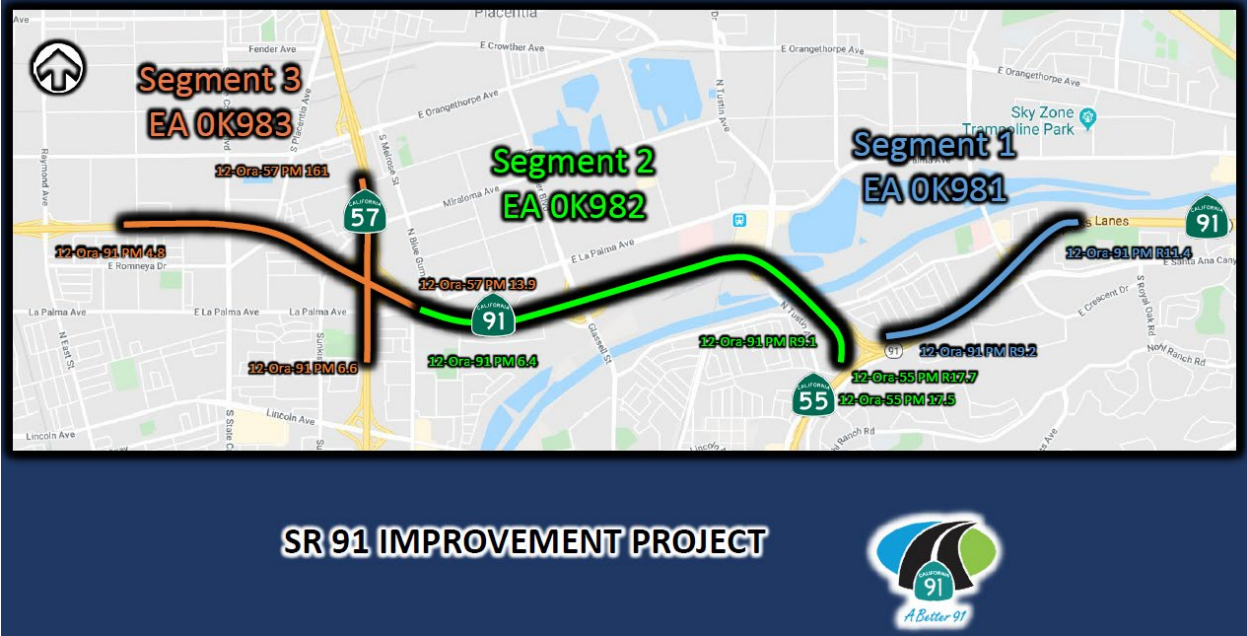
State Route 91 (SR-91) Improvement Project Segment 2