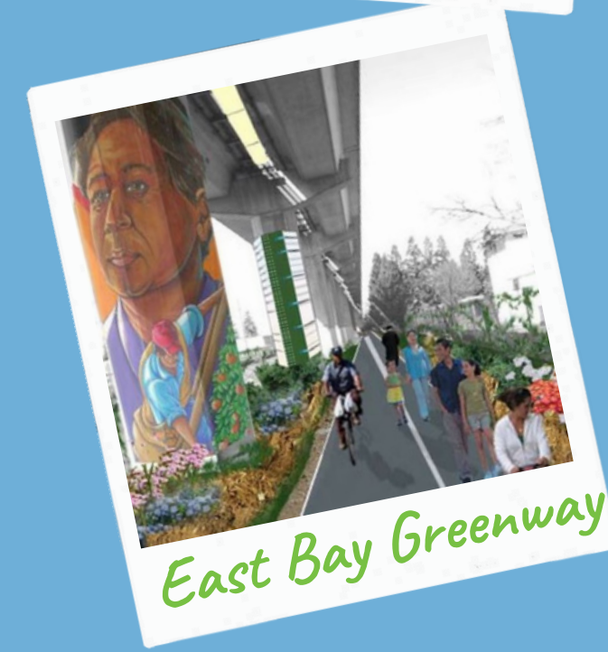
East Bay Greenway

30 new seperated bikeways with over 100 across the East Bay