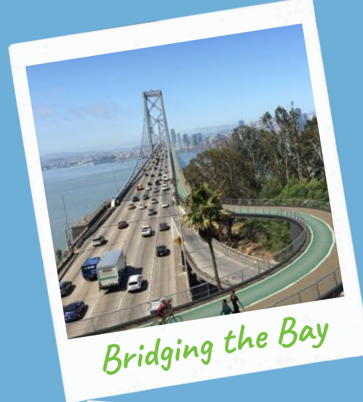
Bridging the Bay

joined our Green Mobility Ambassador training series