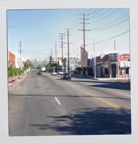
Western Avenue & 40th Street