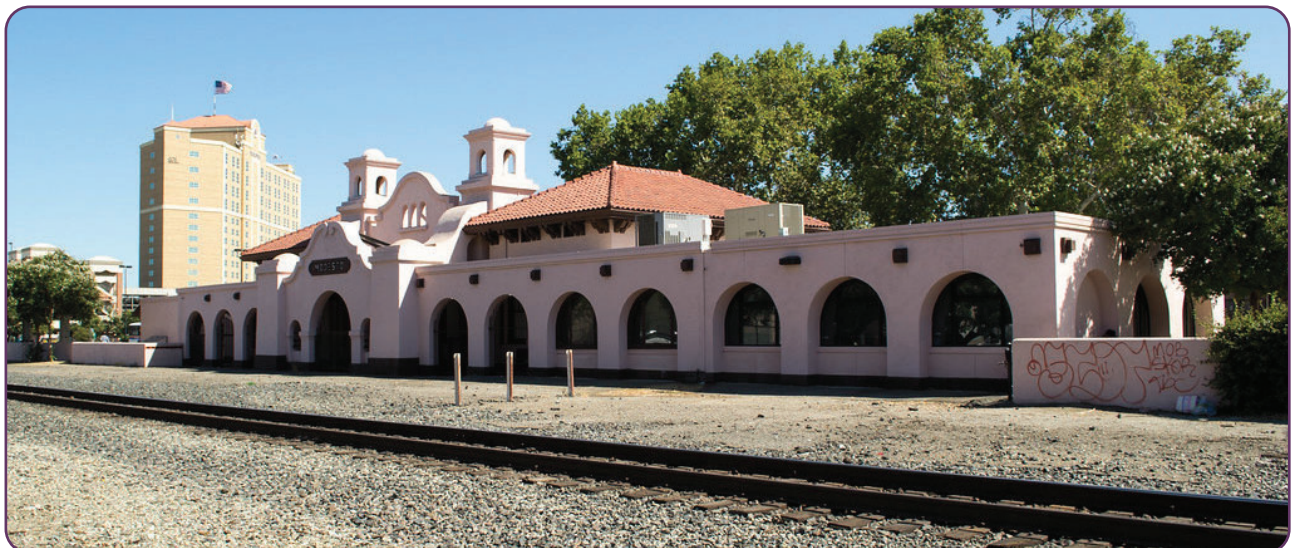
Photo of existing Modesto Transit Center