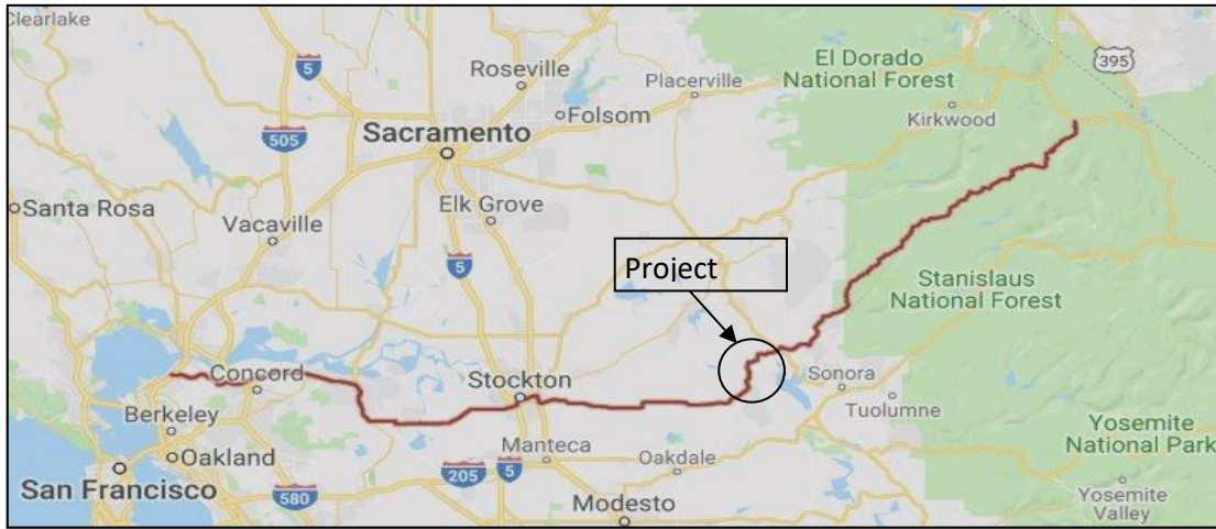
SR 4 CONNECTING SAN FRANCISCO BAY TO THE SIERRA NEVADA

The current non-engineered roadway literally follows the 1840s wagon trail between the San Joaquin Valley and the gold country. It climbs, descends and curves through rolling foothill topography. It lacks shoulders and recovery areas and risks traveler safety with deficient sight distances. Construction of the project will eliminate a truck advisory on SR-4 between the county's only incorporated city, Angels Camp, and SR-99, I-5 and the Port of Stockton. This advisory currently limits truck trailers to under 30 feet in length. Trucks over that length travel out of direction to access Angels Camp and the forestry-related business in the high Sierras along SR-4. One goal of the project partners is for SR-4 to be a continuous Terminal Access (STAA) Route between the Central Valley and Calaveras and Alpine counties to promote economic development.