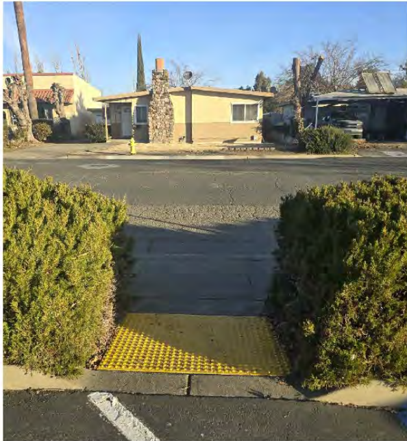
LOCATION FOR MID BLOCK CROSSING - FACING NORTH