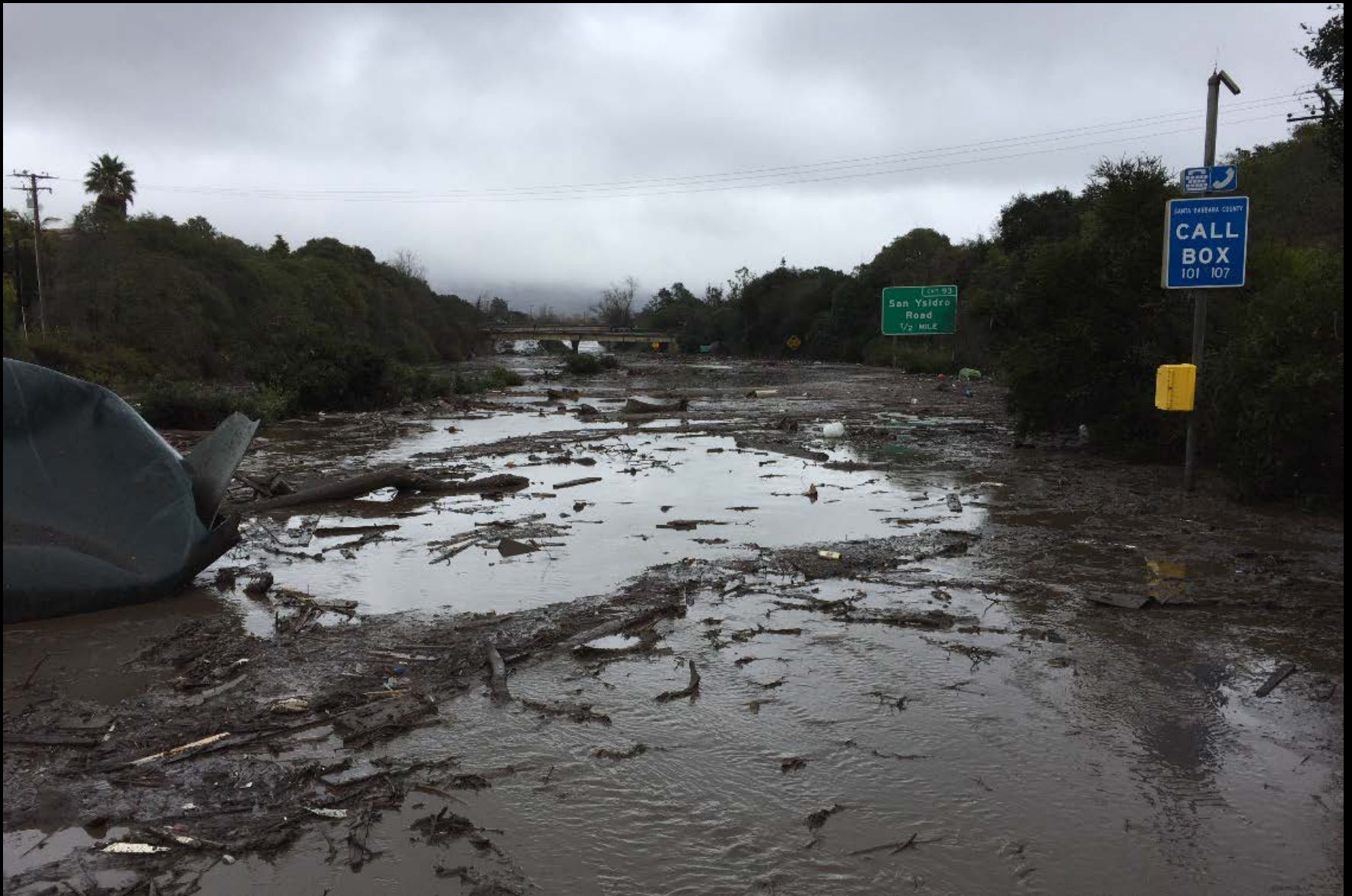
U.S. 101 – Looking towards Olive Mill OC