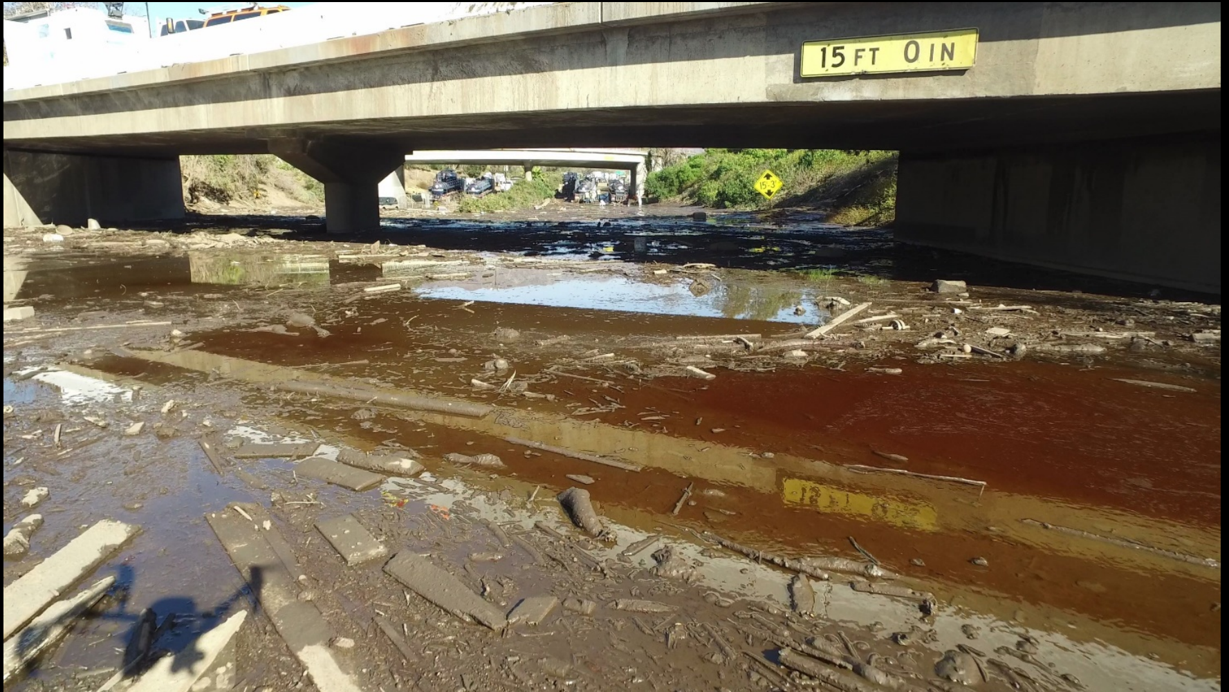
US 101 Buried under 12 Feet of Mud/Debris