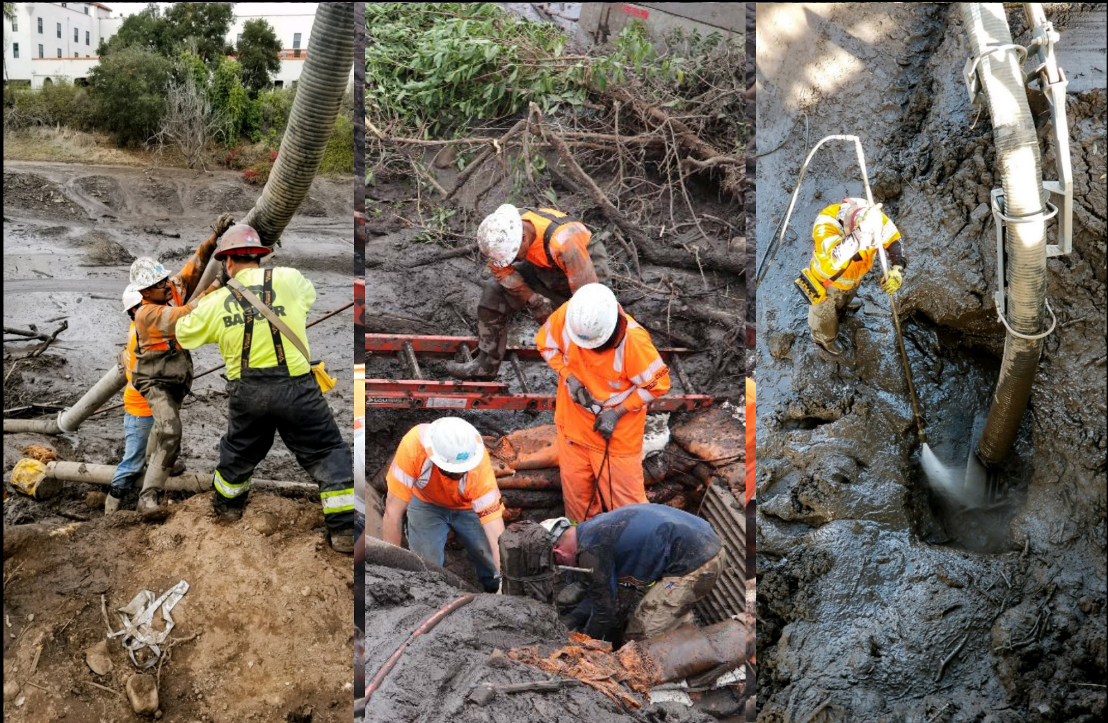
Caltrans works to clear storm drains / culverts