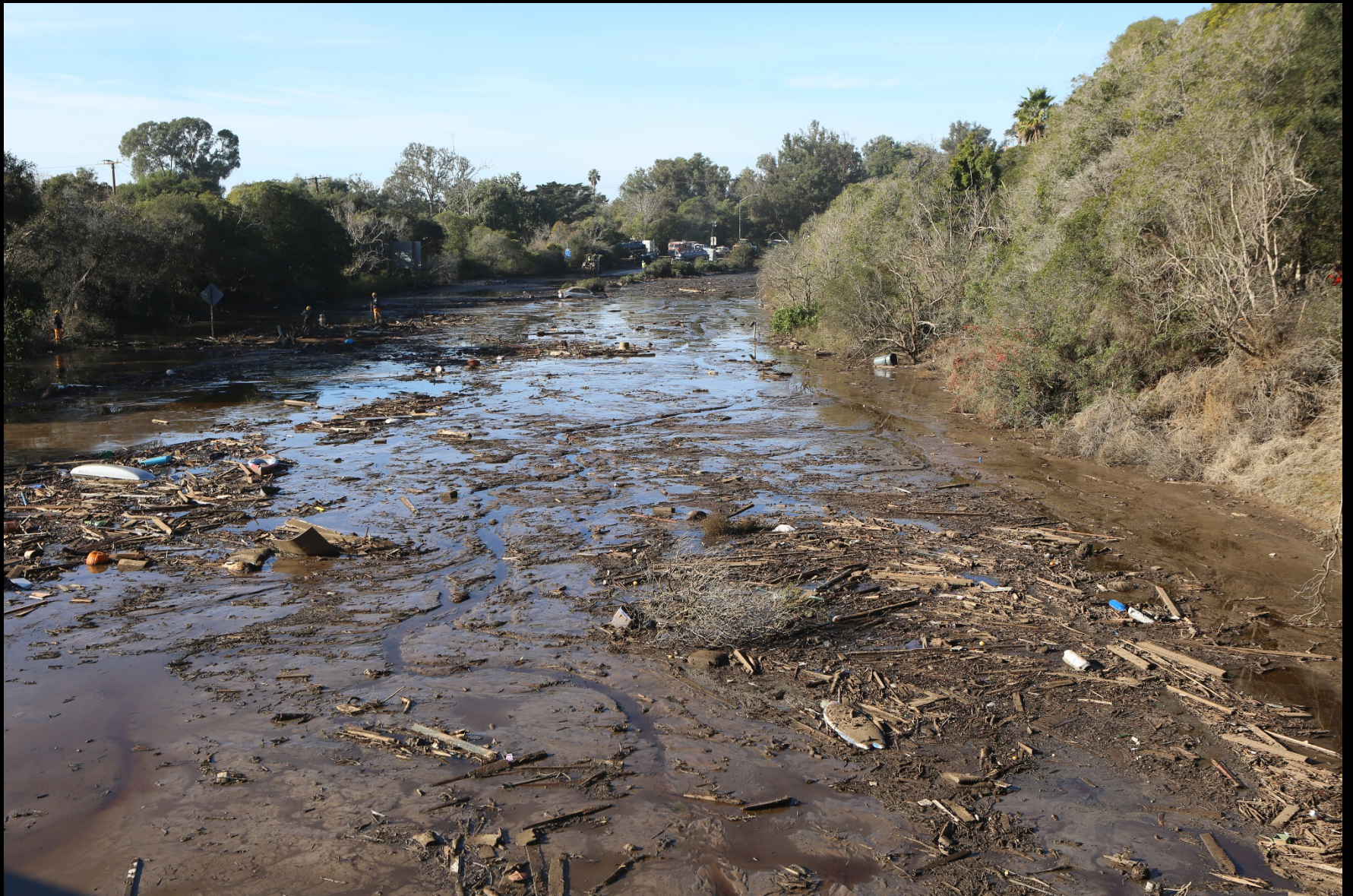
U.S. 101 at Olive Mill Overcrossing