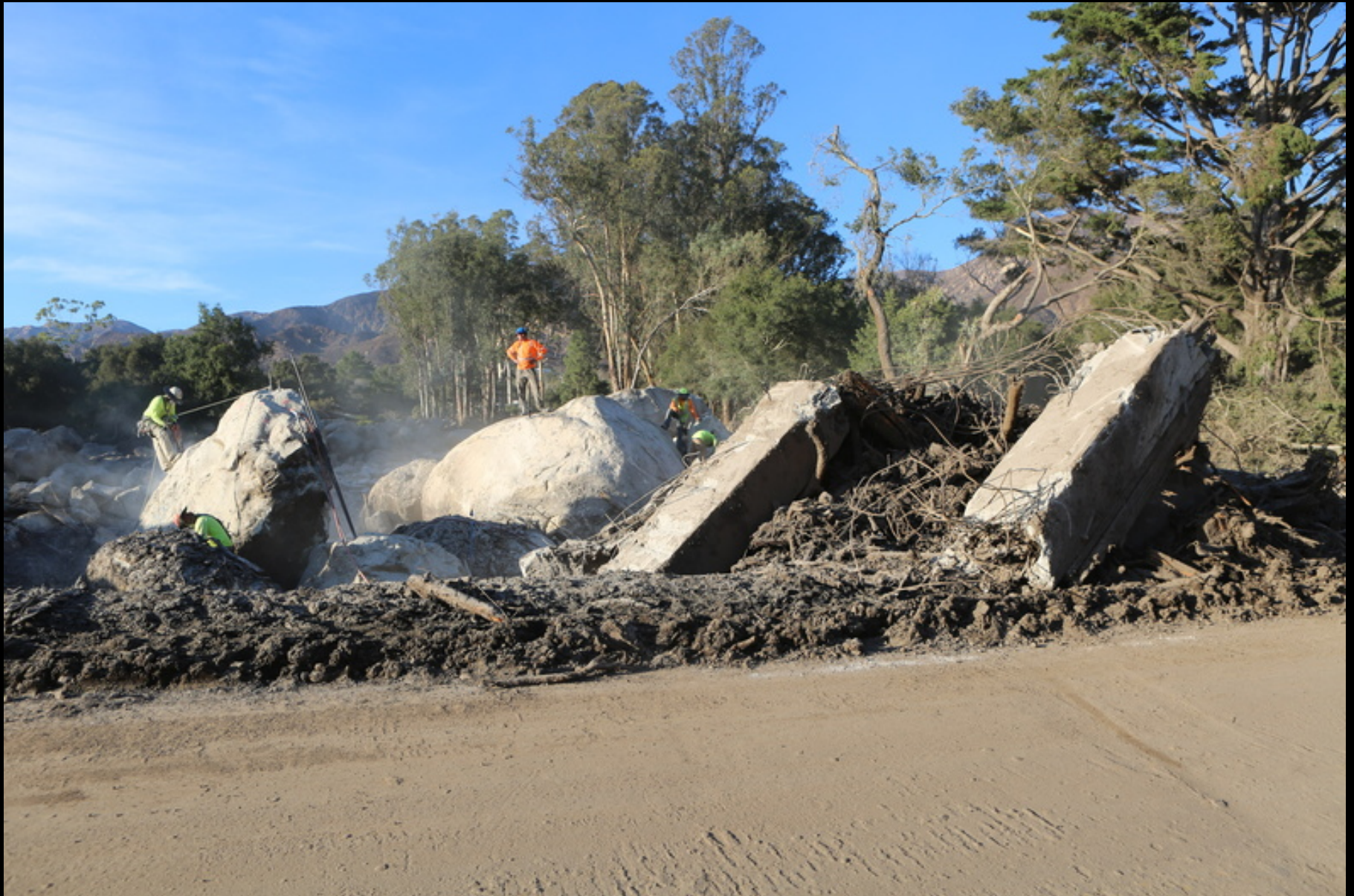
Caltrans crews work to remove large boulders/debris along Hwy. 192