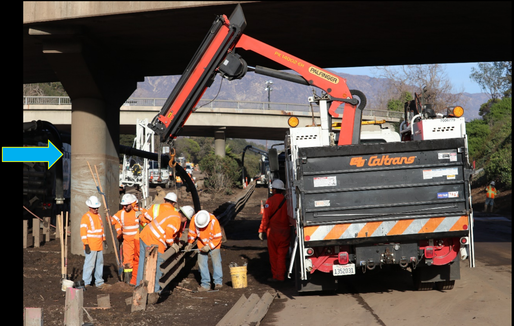
Note debris line on bridge support beam. Crews work to replace damaged guardrail on US 101.