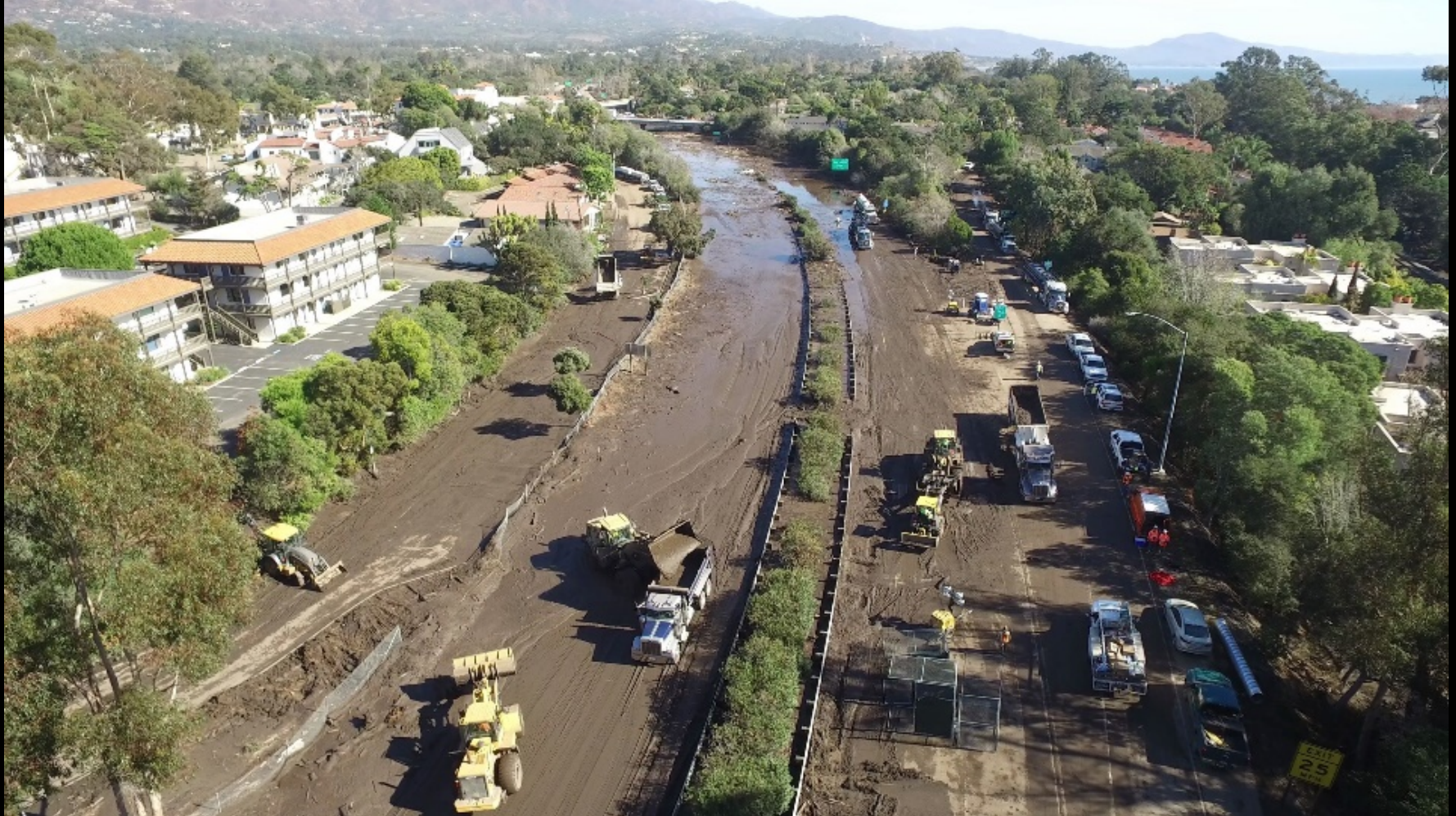
Mobilizing Equipment and Resources