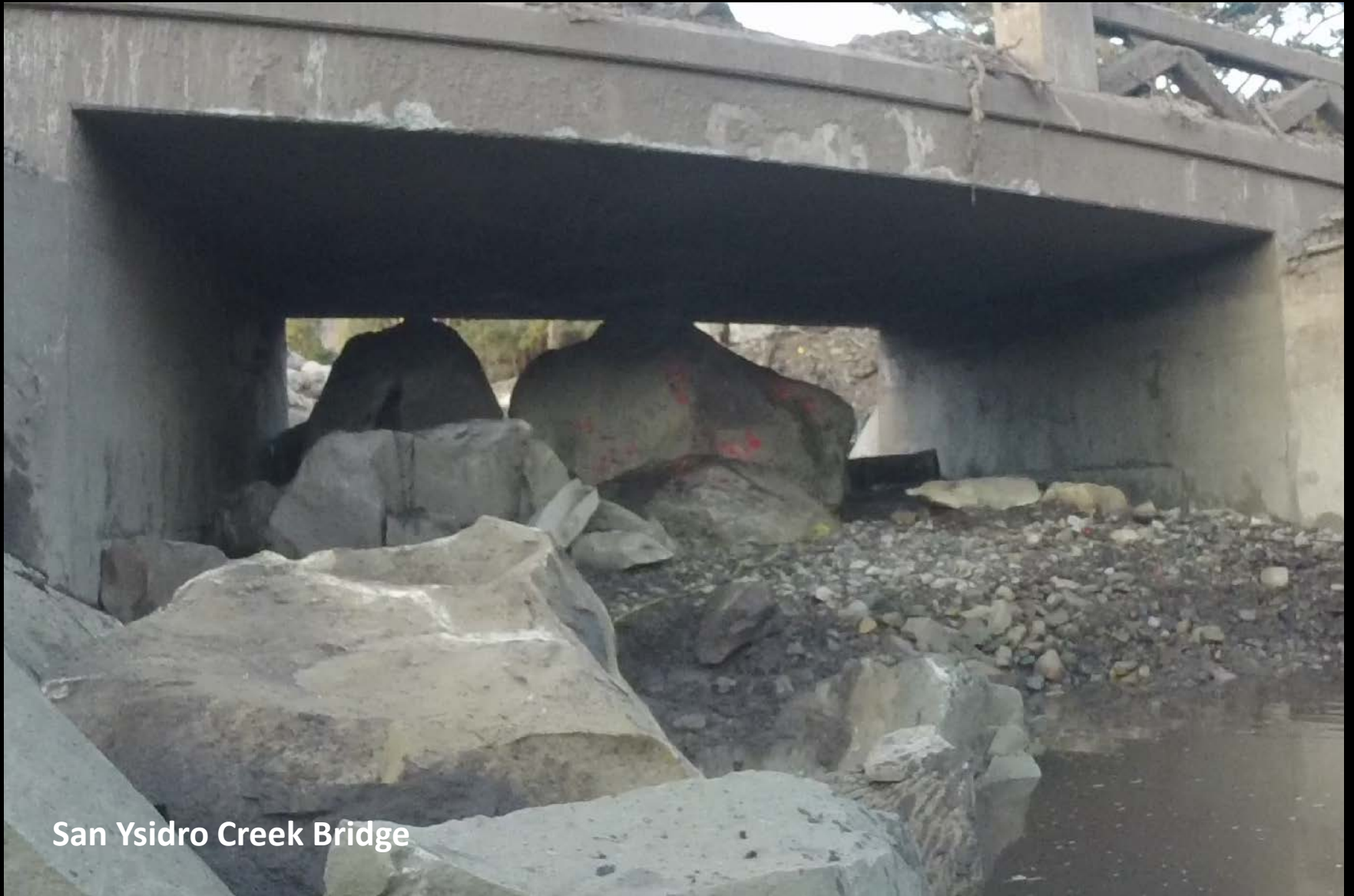
San Ysidro Creek Bridge