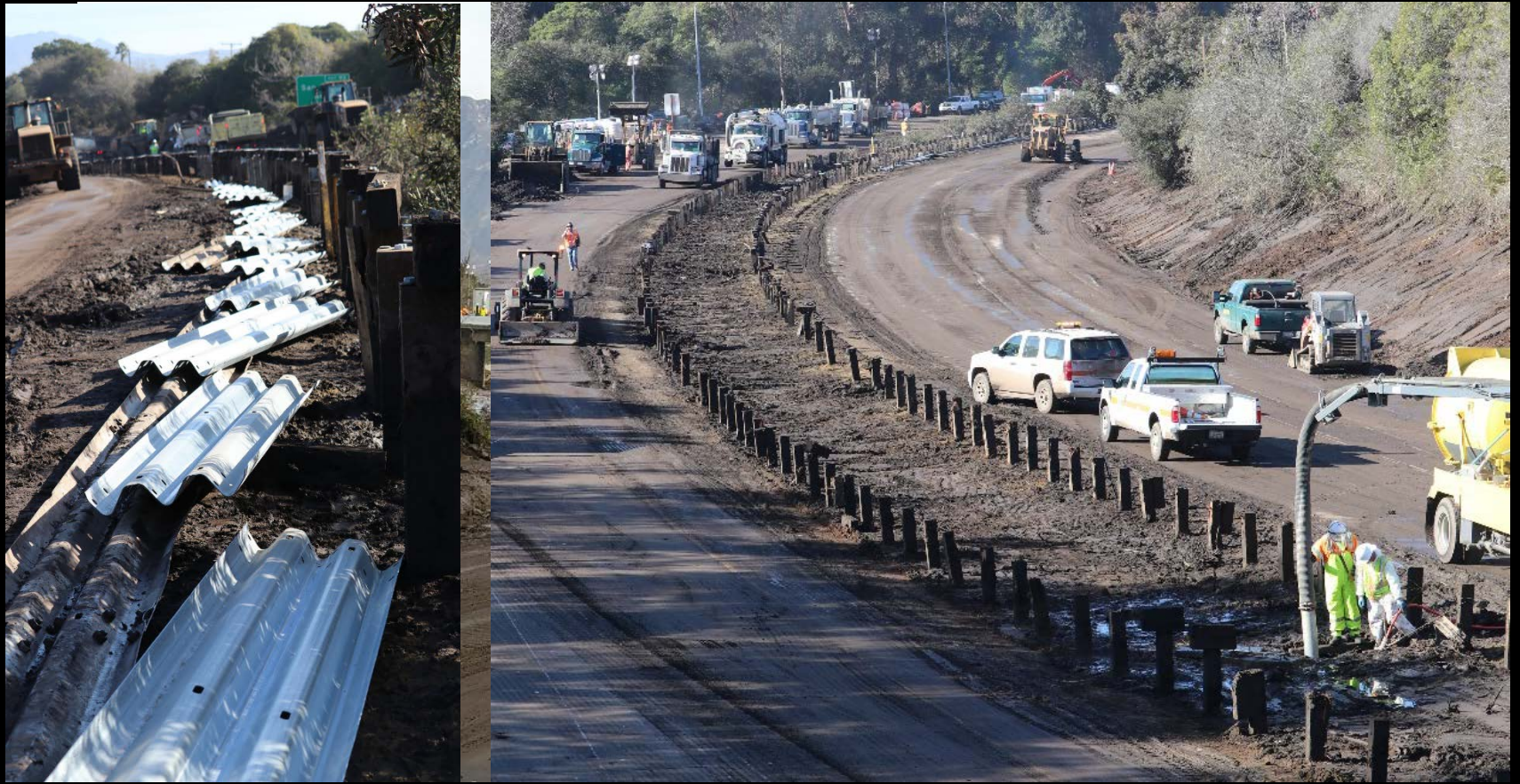
Final work to prepare highway surface