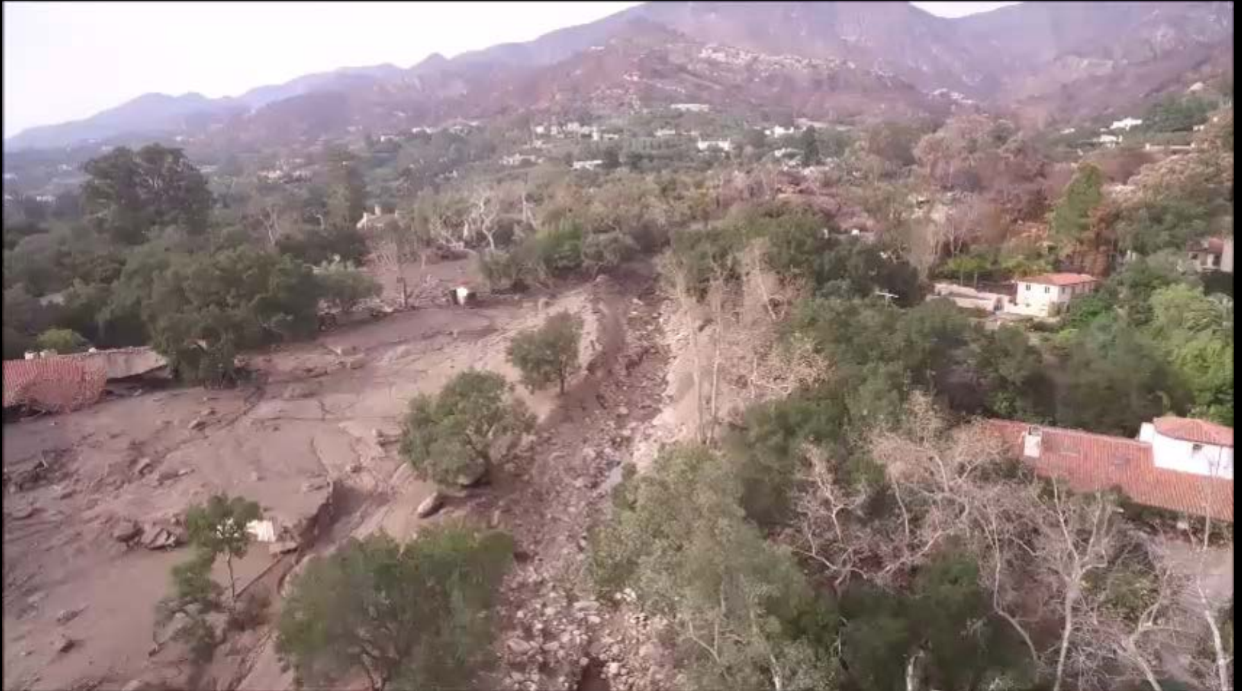
Path of destruction along the banks of the San Ysidro Creek near Hwy. 192