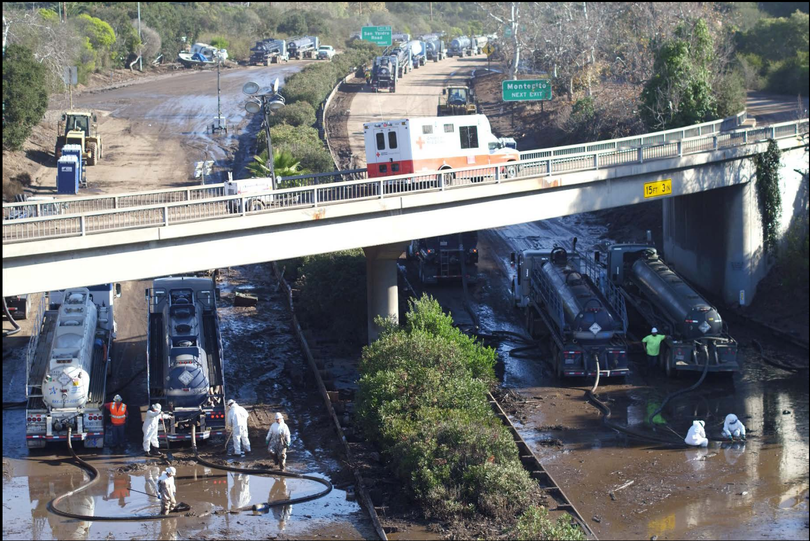
Simultaneous, collaborated work to drain site