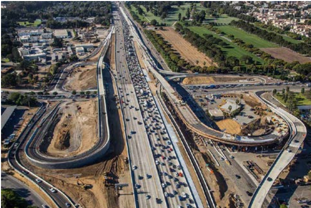
I-405 Sepulveda Pass