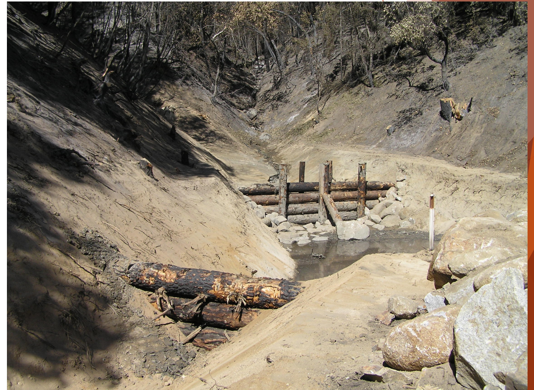
Log Check Dam